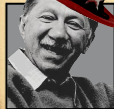
The American dream

"What a man can be, he must be. This need we call self-actualization."